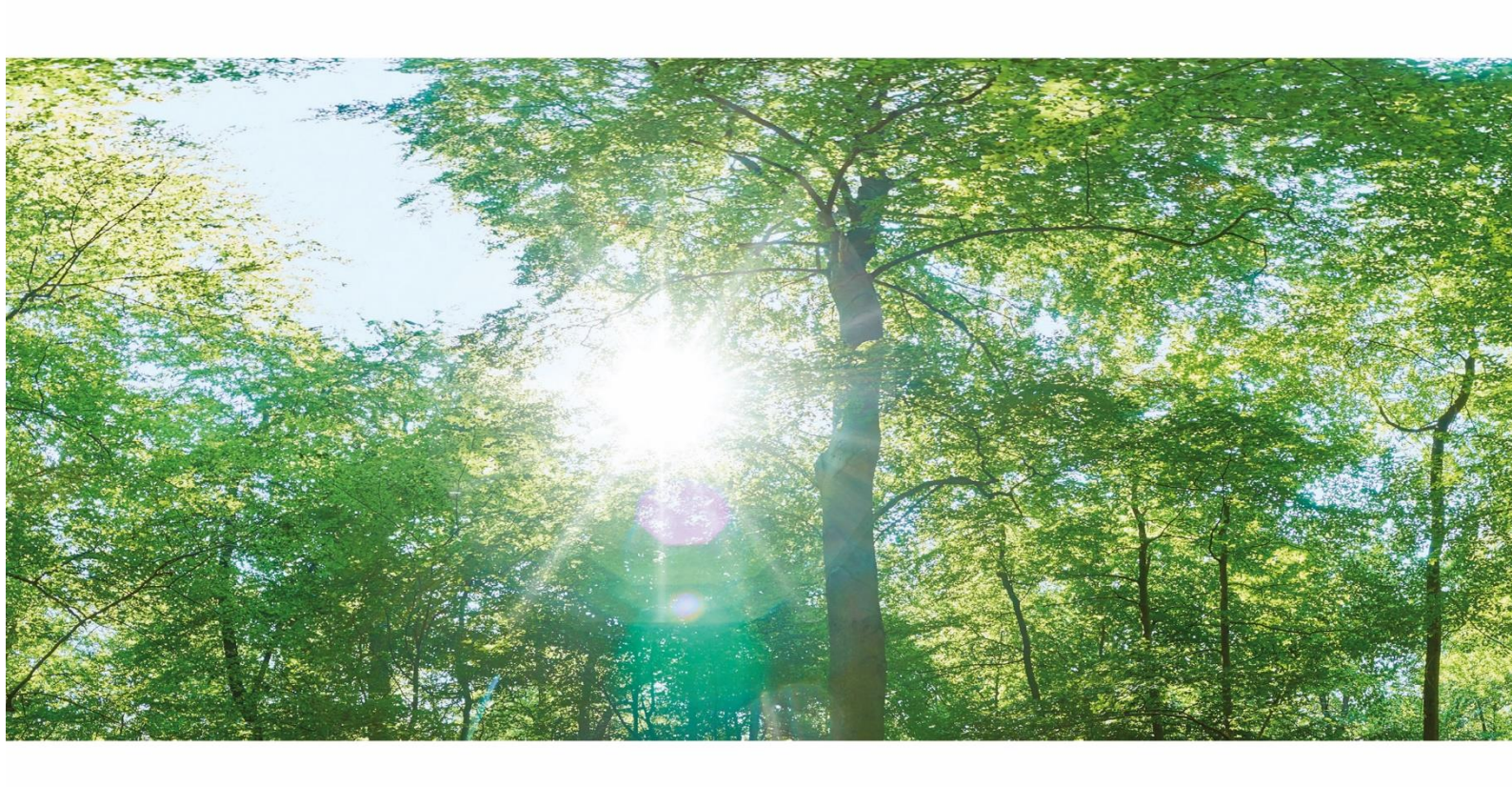
Half-year Report 2022