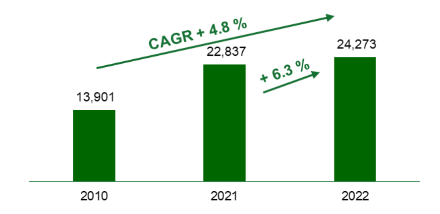
Figure III: Changes in equity since 2010 in € thousand

The equity of the Delignit Group equity rose to € 24,273 thousand as at 30 June 2022 (previous year: € 22,837 thousand), resulting in an equity ratio of 55.8 % (previous year: 57.7 %) due to the higher total assets.